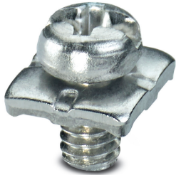
PE screw for contact inserts of A series

Please be informed that the data shown in this PDF Document is generated from our Online Catalog. Please find the complete data in the user's documentation. Our General Terms of Use for Downloads are valid ( http://phoenixcontact.com/download )